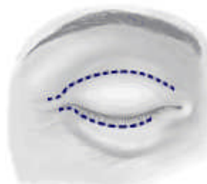
In a typical eyelid reduction operation incisions lines follow the natural lines of the eyelids.