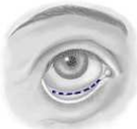
Transconjunctival blepharoplasty - incision made inside.

People who have the familial problem of bags beneath the eyes may well undergo surgery in their 20's. Ageing effects of the skin are apparent earlier in the eyelids than elsewhere. A reduction of the skin can be carried out from the age of 35. Patients with thyroid disease often develop eye signs which can be helped by surgery. Where there is reduced secretion of thyroxine (hypo-thyroidism) there is an increase in fat and where there is an increase in thyroxine (hyper-thyroidism) there is often so much increase in fat that the eyes protrude. An extended eyelid reduction (Olivari's procedure) can treat this satisfactorily.